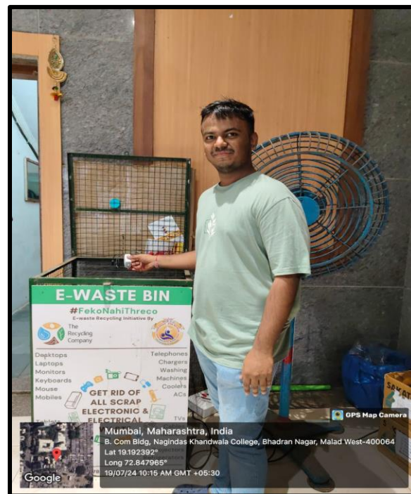
“Students disposing E-Waste”