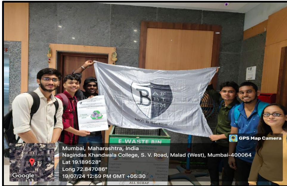
“B- Foundation committee”