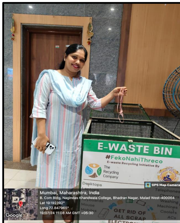
“B-Section department faculty”