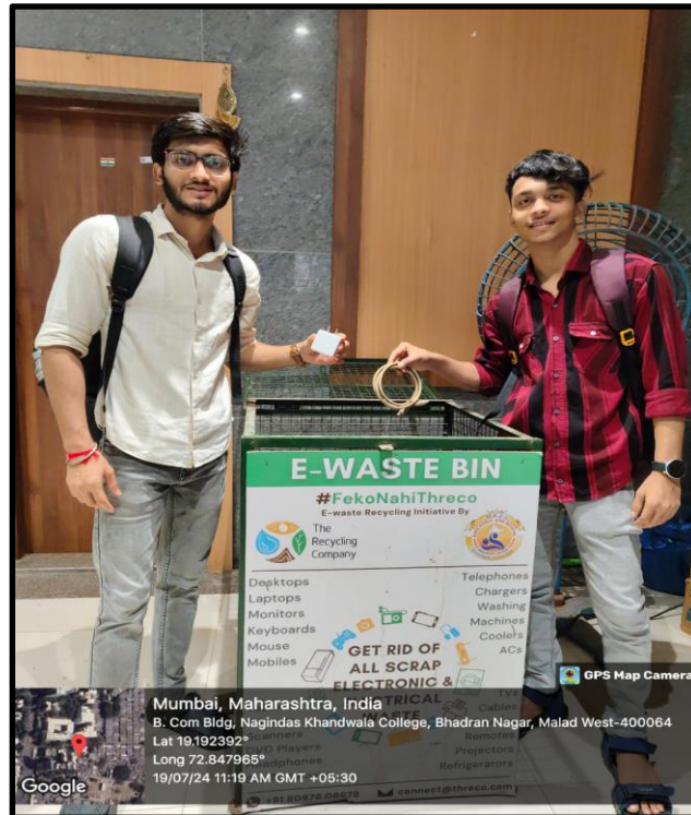
“Students disposing E-Waste”